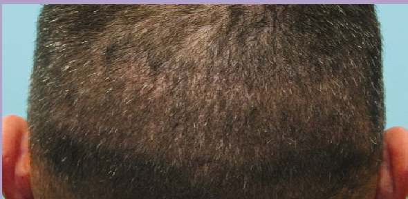
Before (top) and 7 days after (bottom) ARTAS hair transplantation procedure.