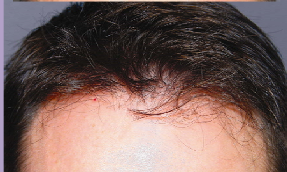
Before (top) and 9 months after (bottom) ARTAS hair transplantation procedure.