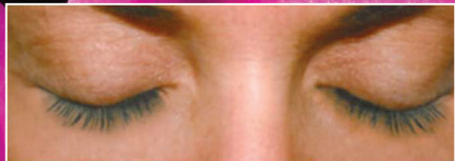
before Grande LASH-MD