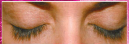
three months after Grande LASH-MD