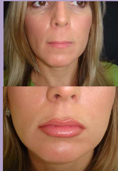
Before (top) and After (bottom) Lip Enhancement.

augmentation in addition to dental work. Dermatologists or Plastic Surgeons can also extend their mastery to patients. In contrast, newly emerging practices can draw in new business. In other words, Vermillion Dollar Lips separates those dabbling in lip augmentation from the specialists. Not only do practices receive expert training and support, but Vermillion Dollar Lips also offers a generous marketing package to ensure a practice's success with VDL. The package includes VDL