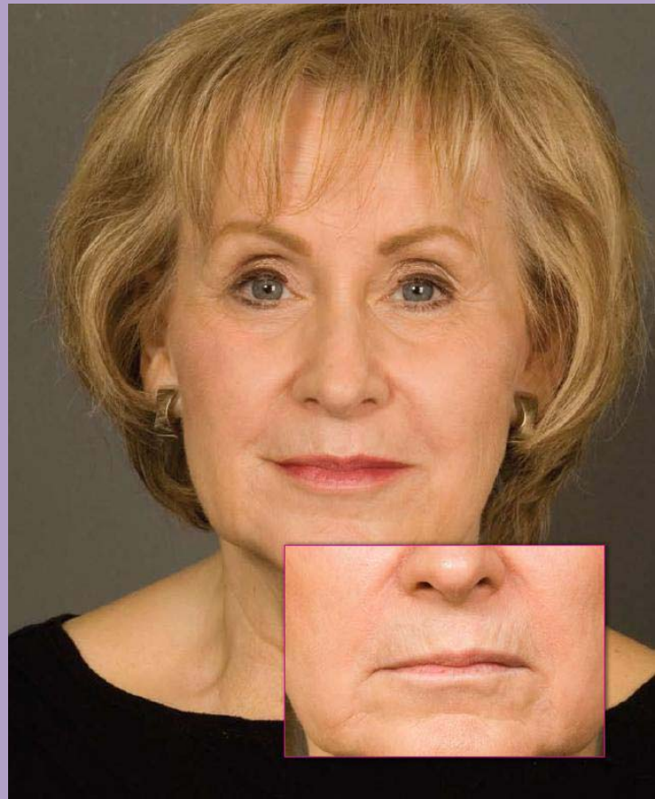
Before and After (inset) Lip Enhancement.